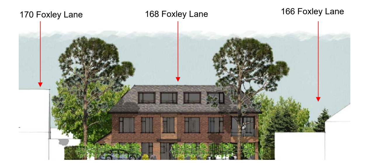
Figure 1: Proposed Streetscene Elevation facing Foxley Lane