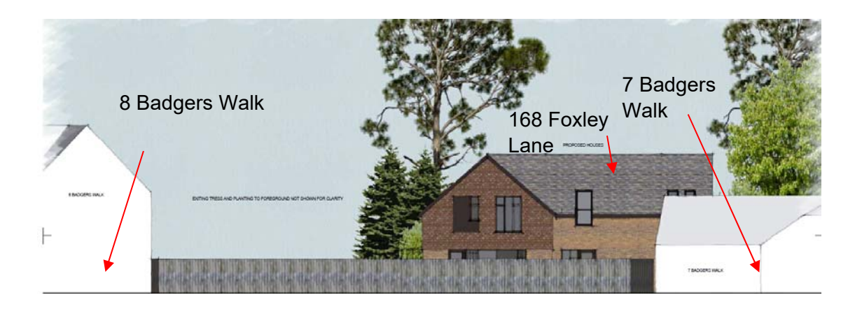
Figure 2: Proposed Street-scene Elevation fronting Badgers Walk

7.12 As shown by Figure 3, the site has been laid out to retain the TPO trees located along the Foxley Lane frontage, as well as other trees located along the rear boundary onto Badgers Walk. A central communal area is proposed between the two proposed buildings, with indicative child play-space and areas for car parking across the site, with access provided via an under-croft, integral to the frontage block.